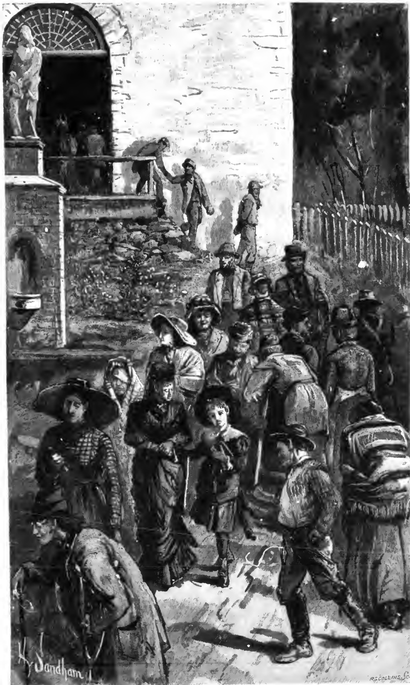
PILGRIMS AND STRANGERS.